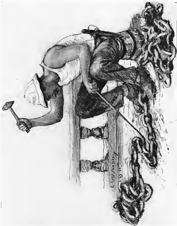
“Ten hours a day Aloysius Pankburn pounded chain rust”